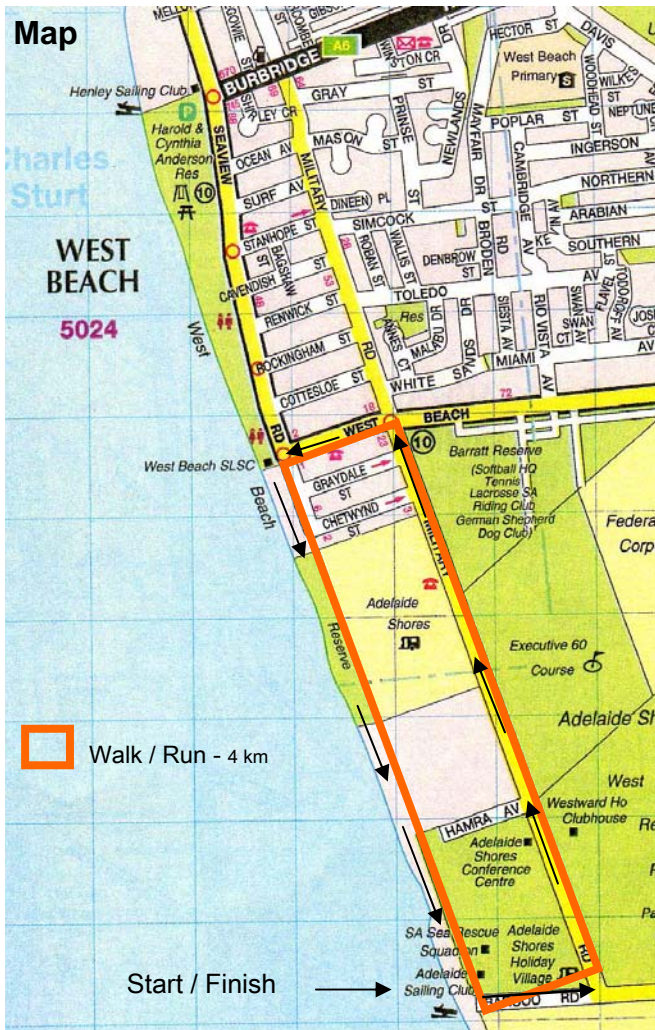
Map section reproduced with permission of UBD. Copyright Universal Publishers Pty Ltd DG 11/08